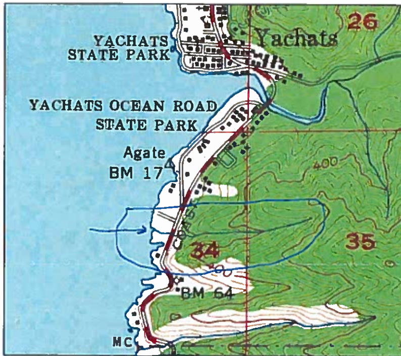
Figure 1. Portion of 1956 "Waldport" 1:62,500-scale U.S.G.S. topo map.