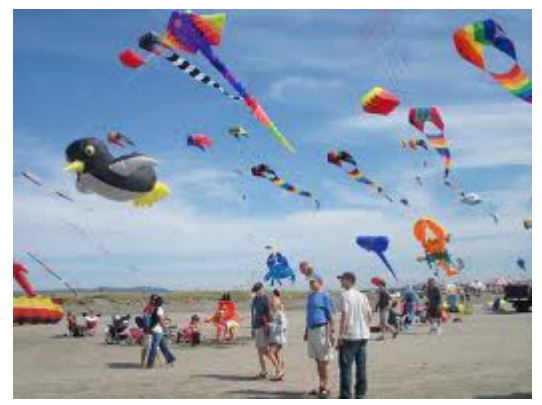
Sky Candy Kite Festival September 13-14<sup>th</sup> Yachats Ocean Rd. Park